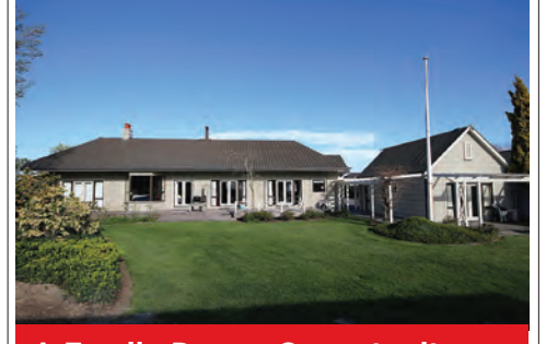
A Family Dream Opportunity