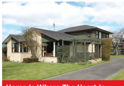
Home Is Where The Heart Is

03 308 0027 | www.mcleodre.co.nz | 208 Havelock Street, ASHBURTON