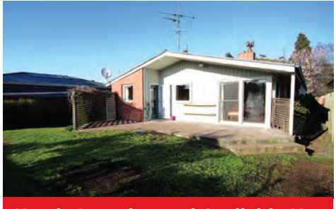
Handy Location and Available Now