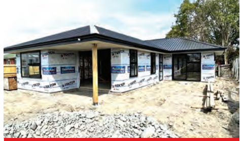
Brand New and Coming Soon