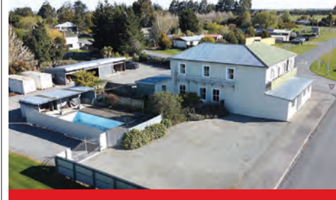
Options Are Endless