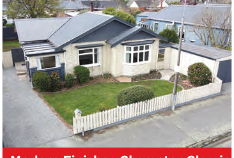
Modern Finishes Character Classic